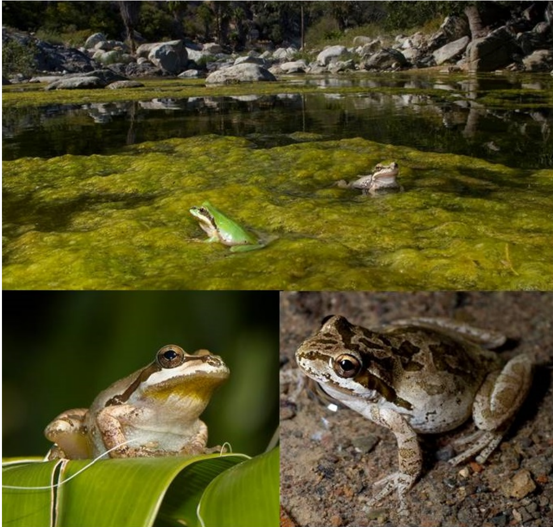
FIGURE 1. Baja California Treefrogs ( Pseudacris hypochondriaca curta) from Baja California Sur, Mexico.